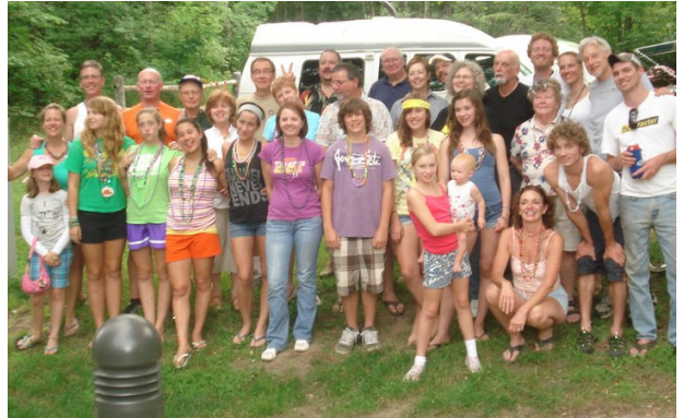
The 2010 Camping Group