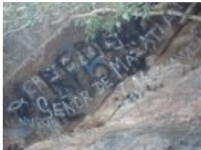
"Cristo es Senor de Mazatlan" (Christ is Lord of Mazatlan) Graffiti on a rock outside Mazatlan, Mexico